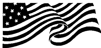
Support Our Troops